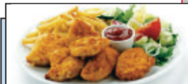
Chicken Tenders 7pc. 15.95 Served with Choice of two sides