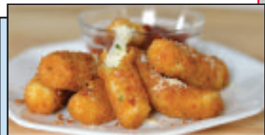
Mozzarella Sticks 8 pc 8.95 | 14pc 12.95 | 20pc 17.45 Cheesy Garlic Breadsticks Served with marinara sauce 7.95 | 9.95 | 12.95