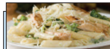
Chicken Broccoli Alfredo 17.95 Chicken breast sautéed with broccoli, finished in an Alfredo sauce over ziti Add Shrimp 6.00